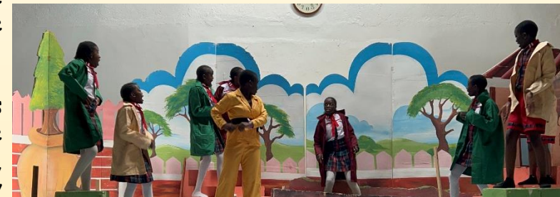
Drama that one the first place in all of Kenya!

Your support and prayers continues to bless the lives of these children. Thank you!