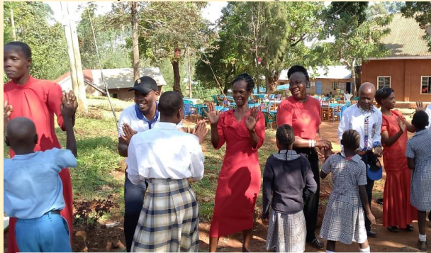
Teachers greeting learners